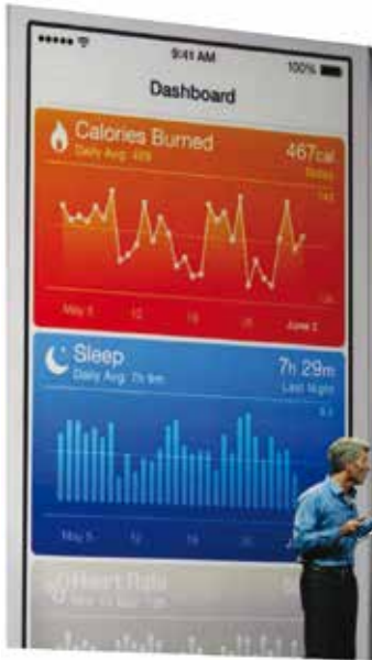
Health app dashboard on display. Ref: Apple, iPhone Conference 2014.

Patented for its unique composition ratio and use, C3 Complex offers consumers a wide range of health benefits. The group of curcuminoids provides protection from free radical damage, it reduces and prevents inflammation and also boosts the immune system. Curcuminoids help to decrease muscle soreness from oxidative stress and inflammation associated with continuous exercise and hence improve athletic performance and endurance.