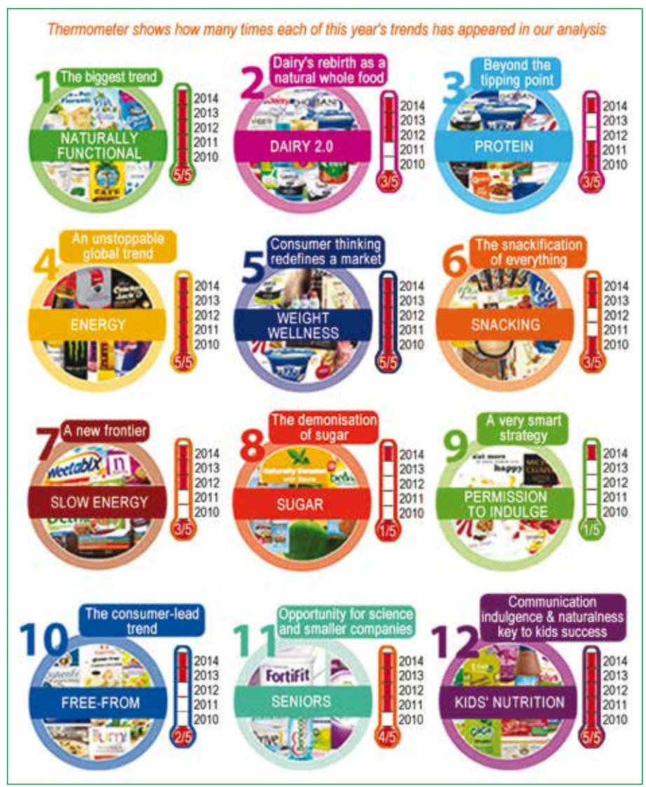
Figure 1. 12 key trends in the business of food, nutrition and health.

Of the leading 12 trends (Figure 1), identified by New Nutrition Business , a leading publication from the Centre for Food & Health Studies based in London, key categories such as Naturally Functioning,